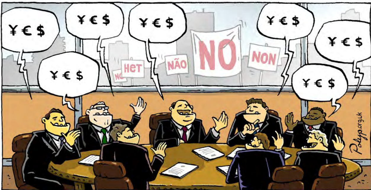
by Polyp (Permission for use issued to La Via Campesina in 2018). More at www.polyp.org.uk

Its giving agribusinesses a free rein to shape the future of our food systems, covered by anti-democratic public policies. Hence, we cannot consider the UNFSS21 as a legitimate multilateral governmental space allowing the autonomous participation of Civil Society. The process towards the UNFSS also clearly shows the increasing corporate capture of some important UN Bodies.