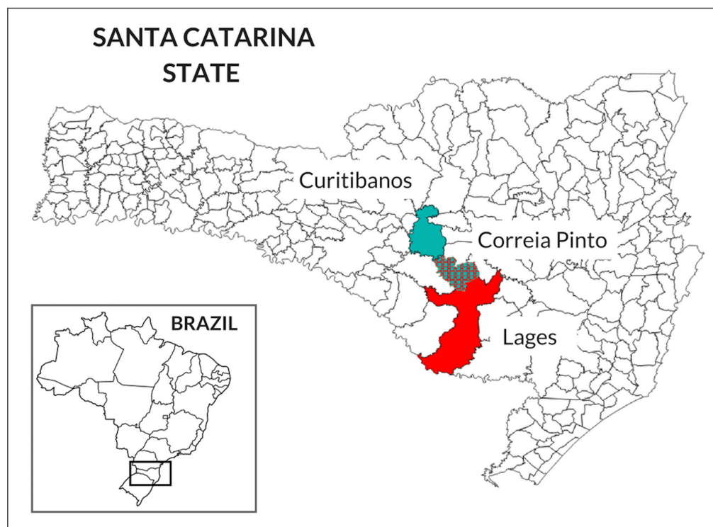
Figure 2: Study site locations. Study site locations in the highlands – Curitibanos, Correia Pinto and Lages – are in the centre of Santa Catarina. DOI: https://doi.org/10.1525/elementa.248.f2

In what follows, we outline the trends related to differences in production systems between certified, in-transition, and non-certified farmers. We outline the most common constraints related to adoption of agroecological practices,