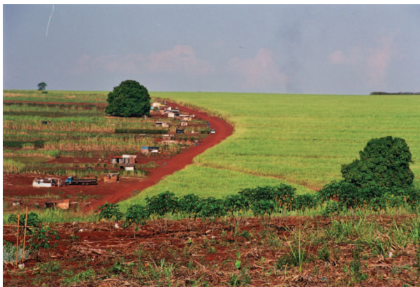
Figure 2. The territorial dispute between peasants and agribusiness is illustrated in this photo of the Mário Lago agrarian reform settlement in Ribeirão Preto, São Paulo, with food production lots to the left and sugarcane to the right.

Notes: By 2009–10, the sugarcane area had expanded yet again to 208,953 hectares but the comparative growth of the settlement area is not yet known. On the basis of observation, it is expected to be negligible.